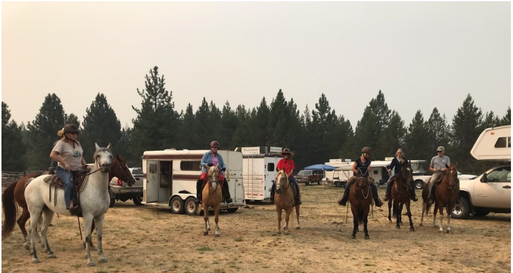
Eight people showed for the fun ride and hot dog lunch at Farragut State Park August 14. It was a hot and smoky day. Trail boss Julie Volpi.